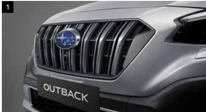
1 Front Grille