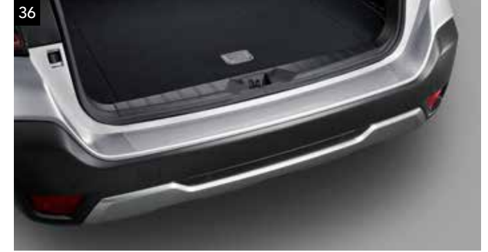
36 Rear Bumper Protection Foil

Protects the rear bumper from scratches when loading/unloading cargo.