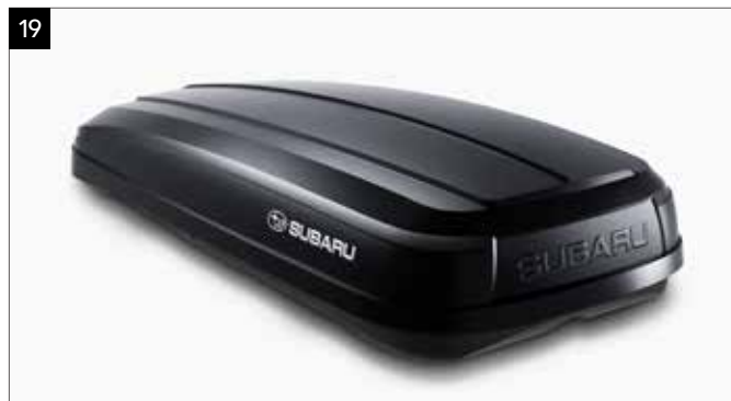
19 Roof Box Short Black