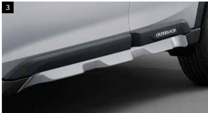
3 Side Resin Underguard

Highlight the design features and protects the body side.