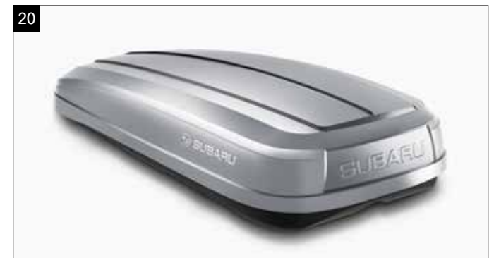
20 Roof Box Short Silver