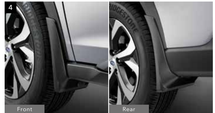
4 Splash Guard Set

Enhances the appearance of the sides and increases the off-road appeal.