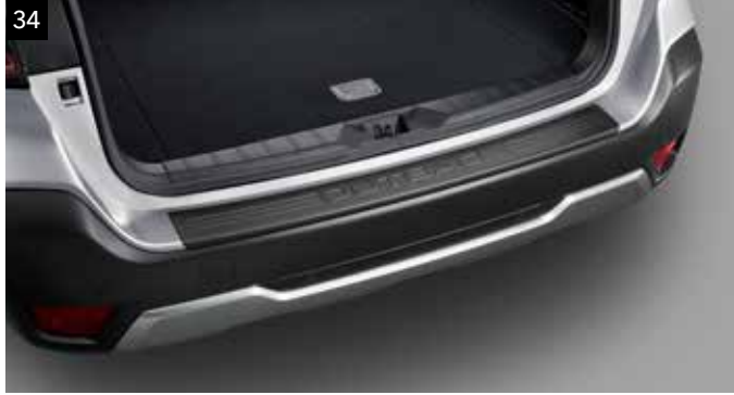
34 Cargo Step Panel (Resin Black)