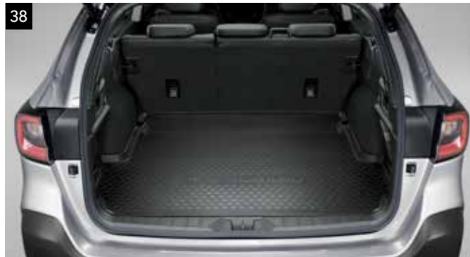
38 Cargo Tray Low

Offers extra protection to the cargo area floor and walls against dust, dirt and liquids.