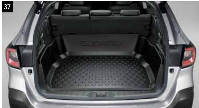
37 Cargo Tray Deep

Transparent film to protect the upper surface of the bumper from scratches.