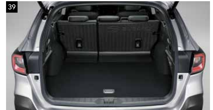
39 Rear Seat Back Protector

Protects cargo area floor from dust and dirt.