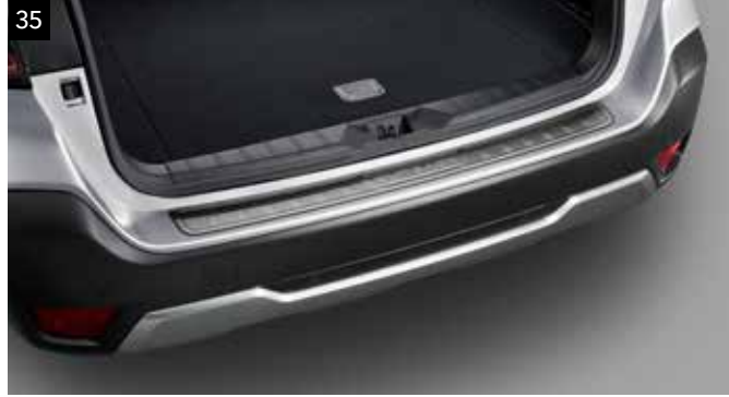
35 Cargo Step Panel (Stainless)

Rugged plastic resin cover helps protect the upper surface of the bumper.