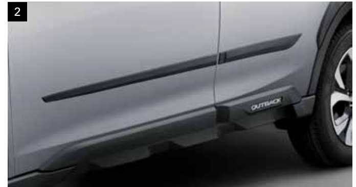
2 Side Protector

The resin-made grid mesh design gives a whole new image to the front. *Requires Camera Cover in case the vehicle is not equipped with a front camera.