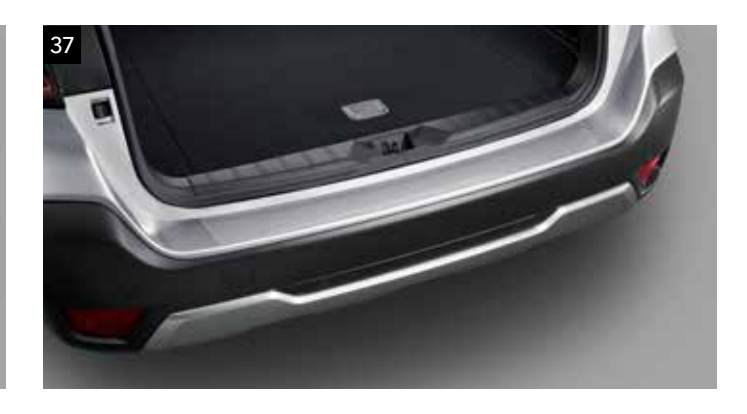
37 Rear Bumper Protection Foil

Protects the rear bumper from scratches when loading/unloading cargo.