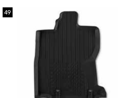
49 Rubber Mat Set LHD/RHD