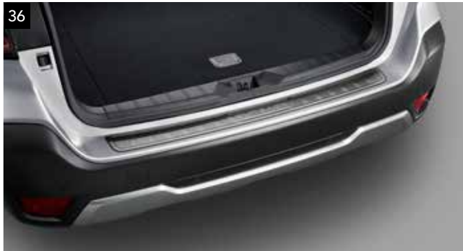
36 Cargo Step Panel (Stainless)

Rugged plastic resin cover helps protect the upper surface of the bumper.