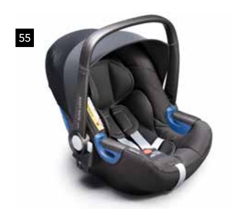
55 Childseat SUBARU Babysafe i-Size