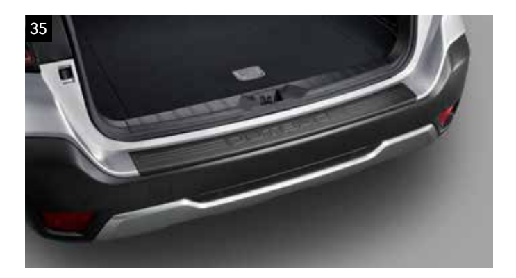
35 Cargo Step Panel (Resin Black)