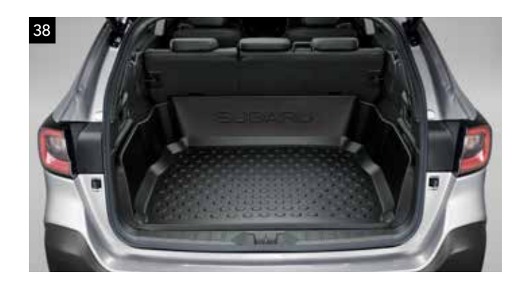
38 Cargo Tray Deep

Transparent film to protect the upper surface of the bumper from scratches.