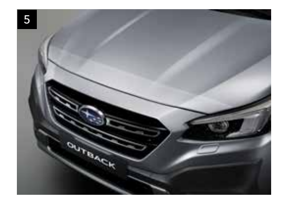
Bonnet Protection Foil