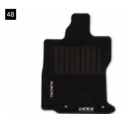
48 Carpet Mat Standard LHD/RHD