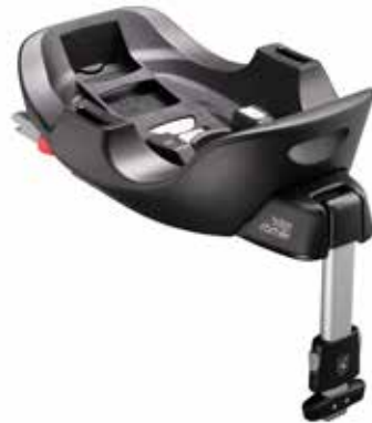
62 Childseat Subaru Babysafe i-Size Flex Base F410EYA310