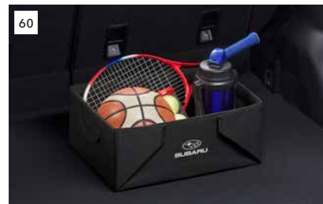
60 Cargo Management Box SECMYA1000

Neatly holds cargo and prevents it from sliding while the vehicle is in motion. Stowable in PVC leather bag.