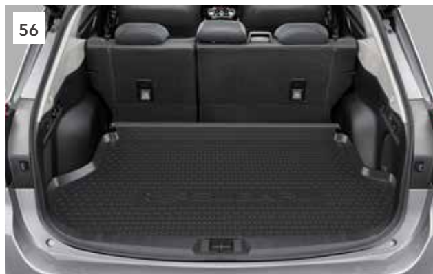
56 Cargo Tray Low J501ESJ000

Extra protection for the luggage space. Suitable for fishing and hunting.