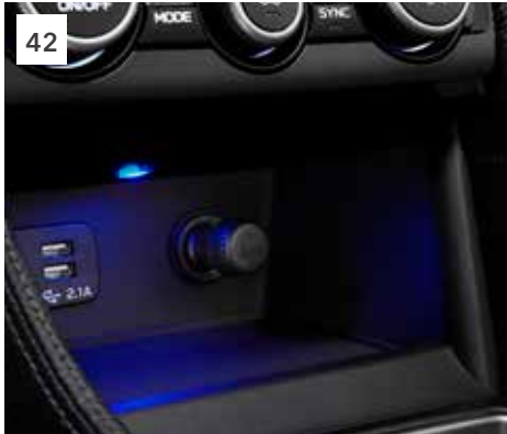
42 Cigarette Lighter Kit H6710AL010 Changes the accessory socket to a cigarette lighter.