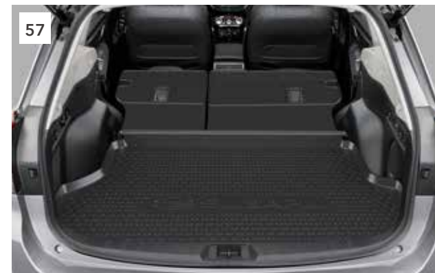
57 Rear Seat Back Protector J501ESJ200

Protects luggage space floor from dust and dirt.