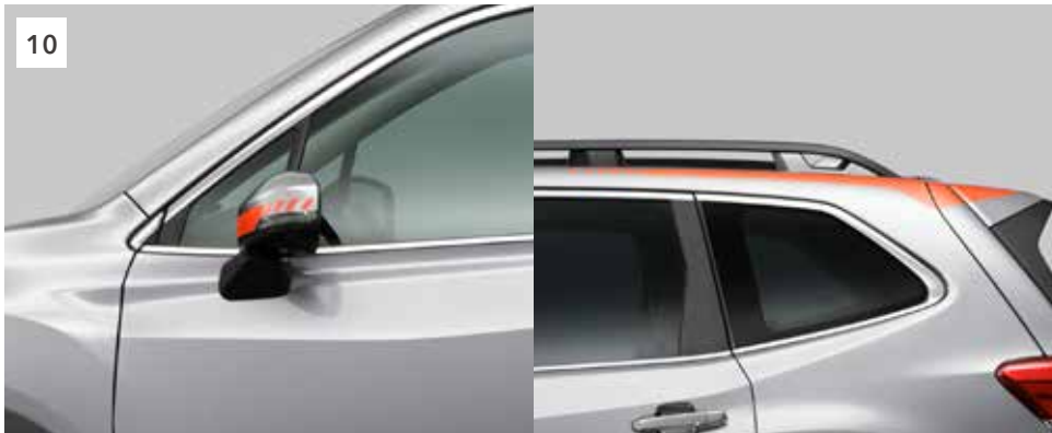
10 Orange Touch Foil SEZNSJ4000

Transparent foil that protects the door handle area from scratches. *Set of 2.