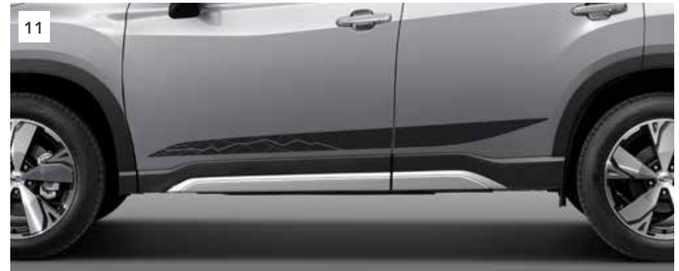
11 Side Decoration Foil SEZNSJ3000

Gives a colourful touch to the exterior.