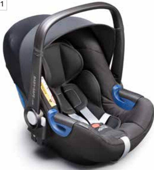
61 Childseat Subaru Babysafe i-Size F410EYA300