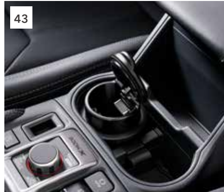
43 Ash Tray F6010AG000 Interchangeable ash tray fits into the centre console cup holder