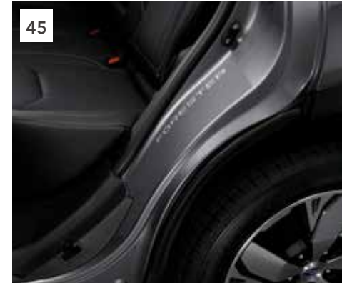
45 Rear Entry Protection Foil SEZNSJ3100 Foil that protects the rear entry from scratches.