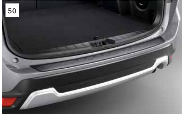
50 Cargo Step Panel (Resin Black) E771ESJ000

Rugged plastic resin cover in brushed aluminium finishing helps protect the upper surface of the bumper.