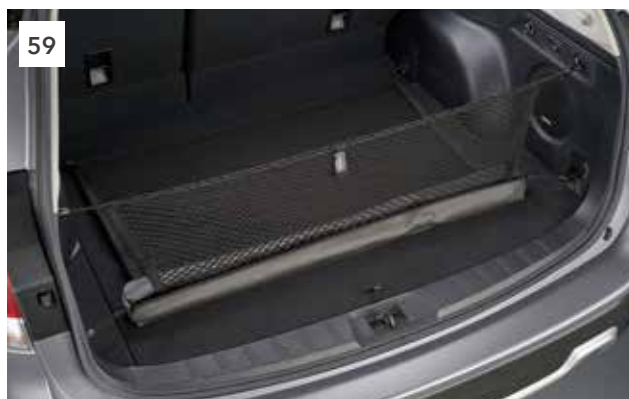
59 Cargo Net Rear F551SSJ000

Mat made of anti-slip material that will prevent luggage from moving around in the cargo area.