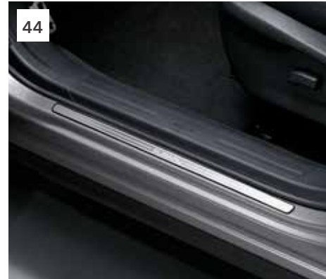
44 Side Sill Plate Stainless E1010SJ010 Elegant stainless-steel sill plate equipped with a Subaru logo. *Front set.